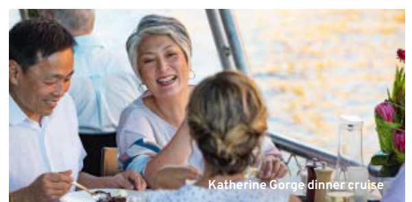
Katherine Gorge dinner cruise